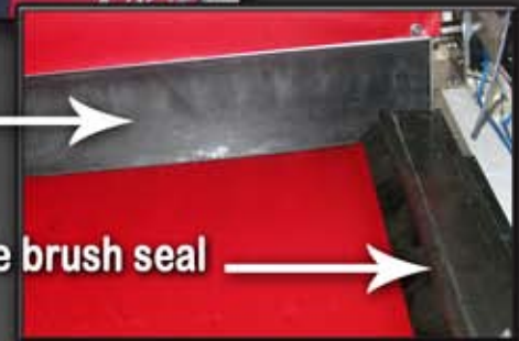
Side brush seal