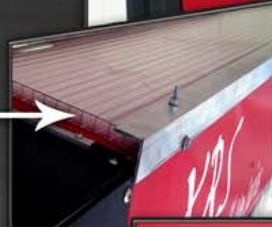
Top rubber seal