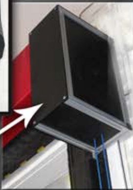
*Optional protective motor cover